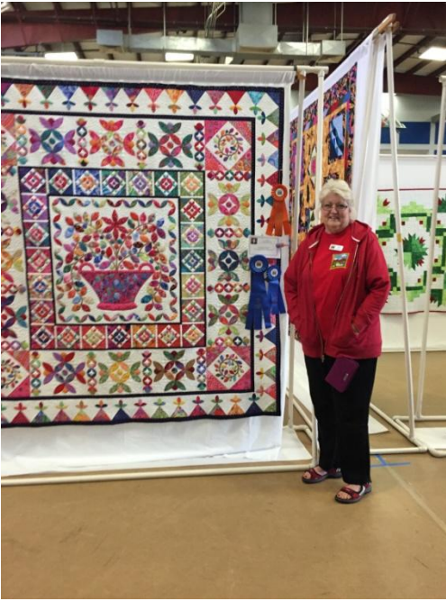
Best of Show/ Viewers Choice