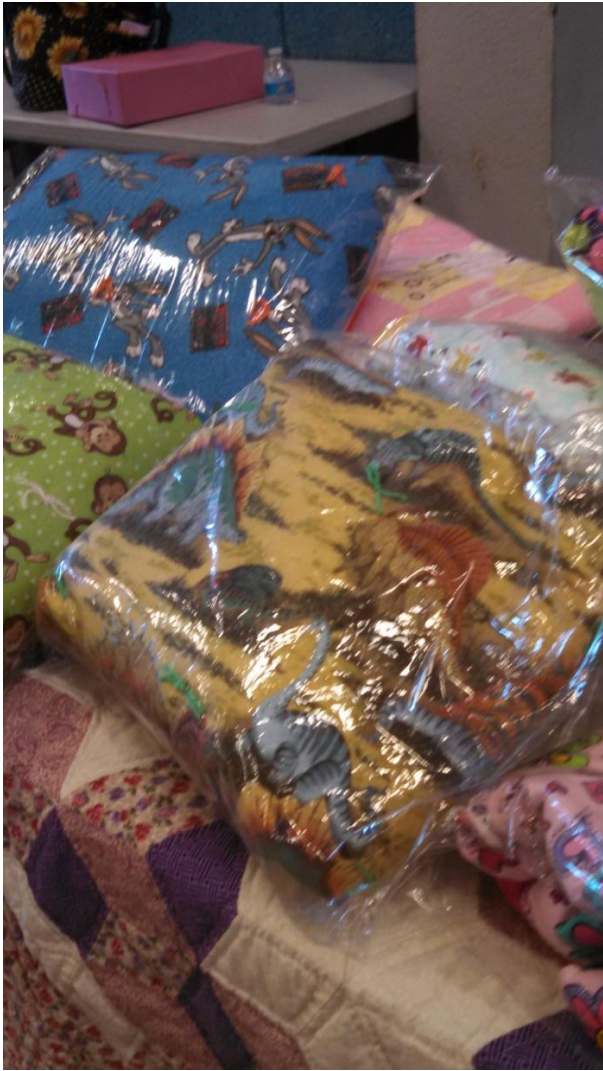
Security Quilts Tied at the quilt show.