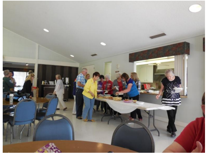
Snack Time at February meeting