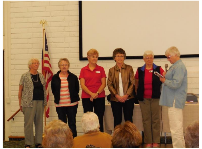
Our new Board for 2016/17